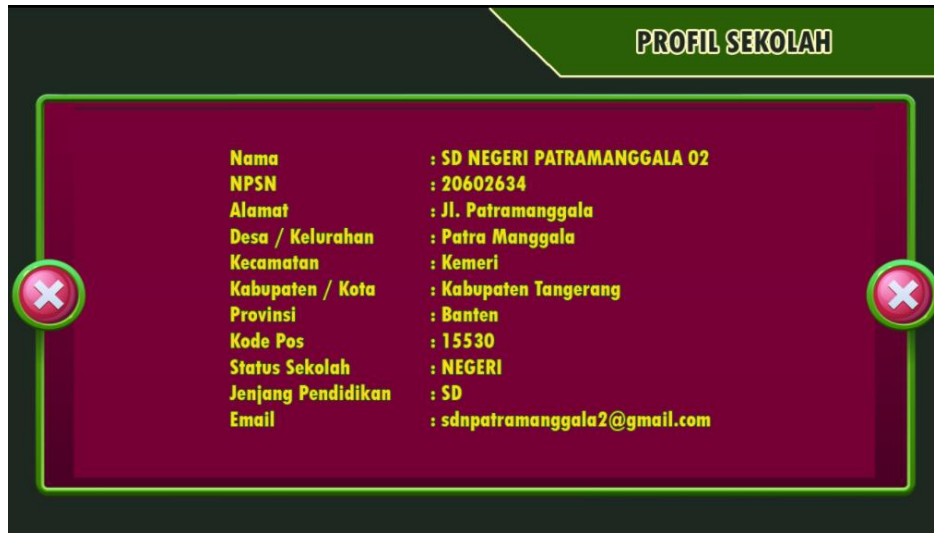
Figure 7. Profile UI

The image above shows that there are several buttons, including return to menu, and there is a panel to display the quiz score answered by the user. The next section is the Profile UI: