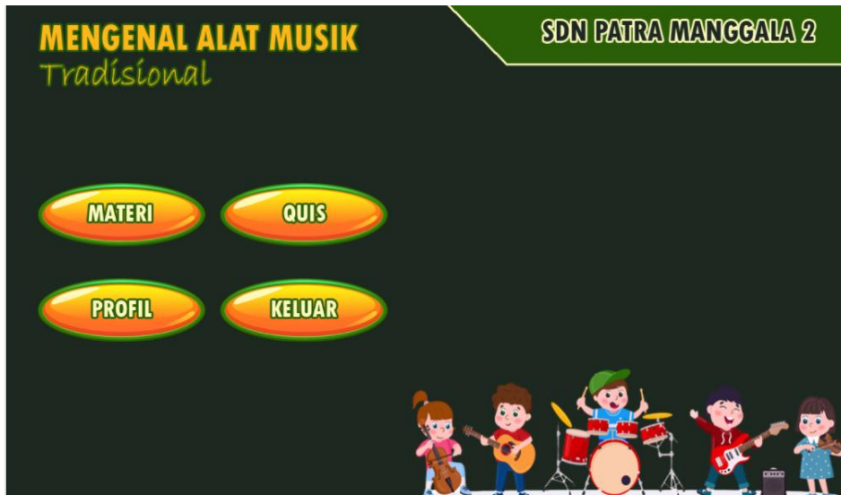
Figure 3. Menu UI

User Interface (UI) design is a stage in designing the visual appearance and interactions within an application. The main objective is to create an interface that is user-friendly, visually appealing, and easy for users to understand. The general stages in the UI design process, especially for an educational application introducing traditional musical instruments, can be described as follows according to the flow in the previous flowchart: