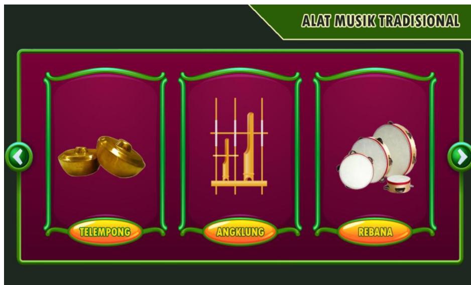
Figure 4. Materials UI

The image above shows that there are several buttons, including exit, materials, quiz, and profile. The next section is the Materials UI: